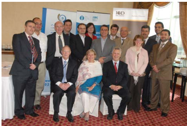
Participants of the Training of Trainers – Corporate Governance Board Leadership Program, Abu Dhabi – July 28 to 31

For these main reasons, and others, companies and their Boards throughout the region are evaluating their current governance and looking to introduce accepted or leading practice. Mudara IOD is pleased to provide a forum to enable Board members to share their experiences and learn from each other as they go through the challenge of making their businesses sustainable. Our Internationally accredited Director Development Programme and workshops on special areas of Board skills and practices are also available to equip Board members and potential Board members for the task.